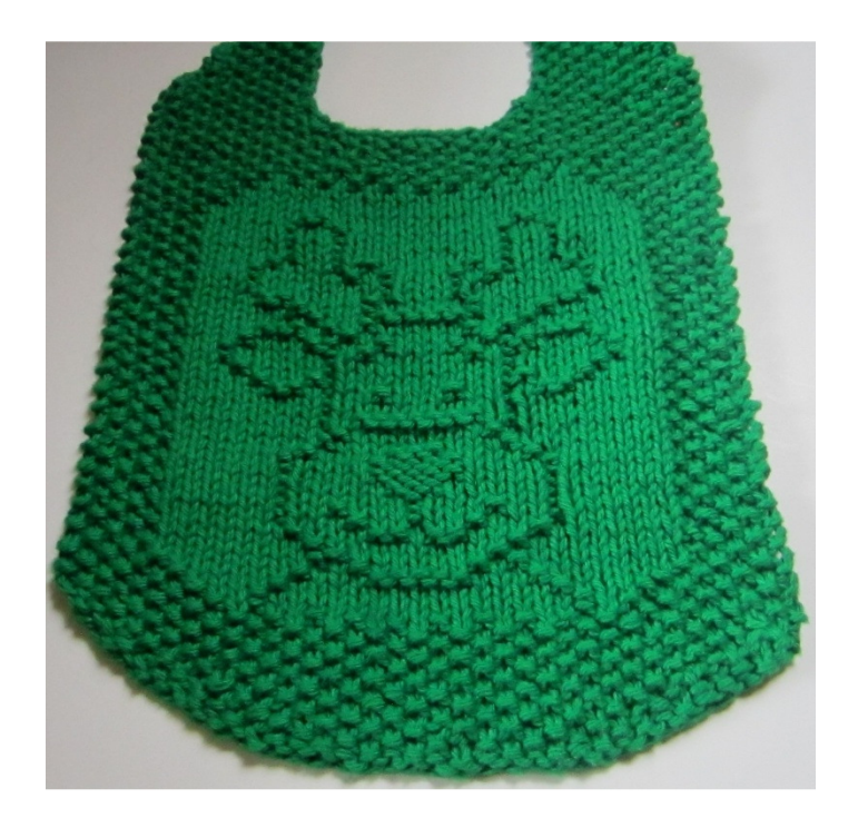
Copyright 2019by Elaine Fitzpatrick. Permission is granted to make and sell items from this pattern provided that credit is given to me as the designer. Permission is not granted to reproduce the actual pattern, or post it, or distribute it, without my express permission. You may, of course, make a copy for your own personal use. Please respect my copyright and play nice!

Size: approximately 8½" from neck edge to bottom and 8" wide